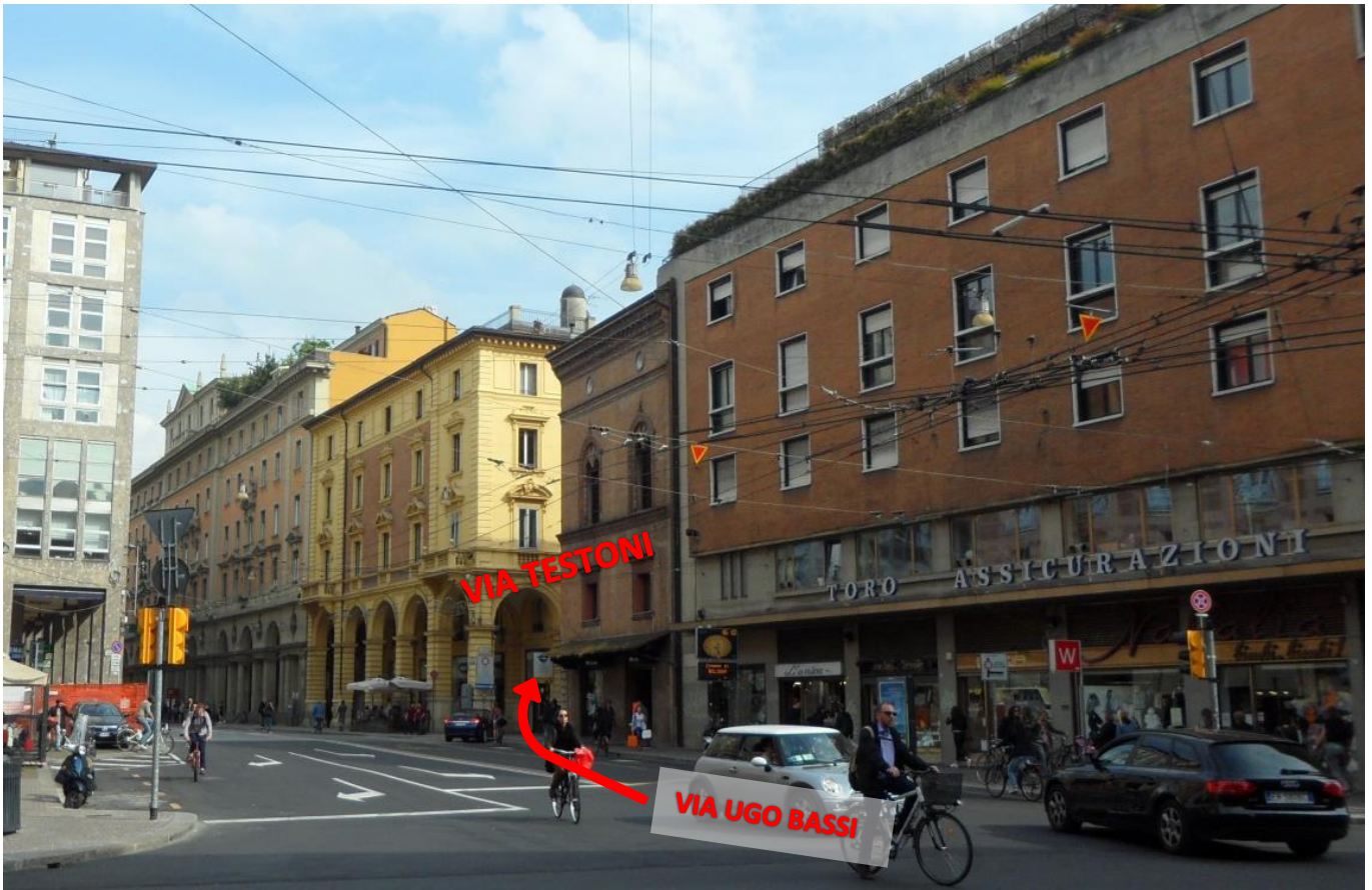
(signage indicating the hotels)